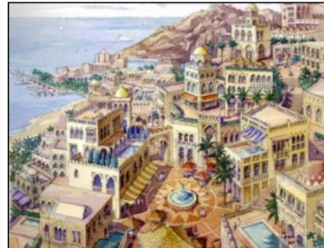
Salam Yiti Resort