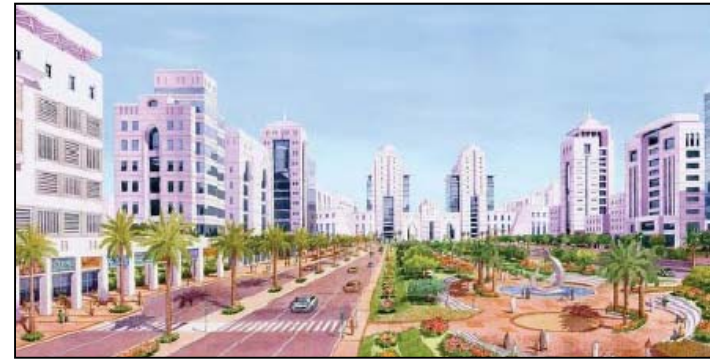
Al Madina A'Zarqa or The Blue City