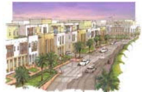
The Wave, Muscat

As the biggest event that is dedicated for all requirements of the sultanate's vibrant building and construction industry, the exhibition is the perfect venue for showcasing the products and services you offer to all your potential clients.