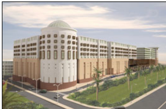
Tilal Al Khuwair