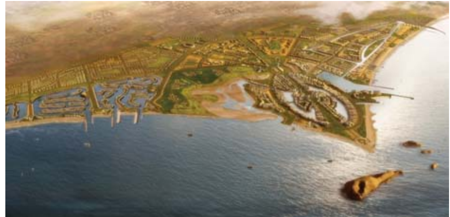
The US$15-billion Al Madina Al Zarqa or The Blue City

The BIG Show 2011 can put your company in a position to effectively take advantage of growing opportunities in the market.